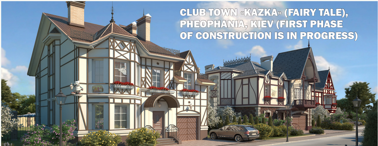
CLUB TOWN «KAZKA» (FAIRY TALE), PHEOPHANIA, KIEV (FIRST PHASE OF CONSTRUCTION IS IN PROGRESS)

Club town «Kazka» (Fairy Tale) is situated in one of the most picturesque and old places of Kiev – it is adjacent to the reserve «Theophania» and St. Panteleimon monastery. The club town «Kazka» consists of blocks of 2 and 3-storey town houses and cottages with house land plots, a cozy park with fountains, pavilions and sculptures, and children’s playground. All houses are in the same Western – European style, with that every house is unique by its architecture and colour scheme. Streets are named after well known fairytale writers. The playground for children is planned.